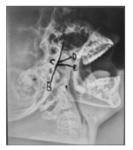
Figure 1: Lateral PNS X-ray, AB: Line along anterior margin of basiocciput, C: Sphenobasioccipital synchondrosis, CD: Nasopharynx, CE: Adenoidal tissue.

practitioners. If left untreated, it may lead to unwanted pathological changes in the heart, lungs, and craniofacial growth of a child.<sup>[10,13,14,17-19,28]</sup> This study assessed the ANR of participants and compared it with the clinical features that they presented. A total of 66 participants were enrolled in this study. Out of these, 50 (75.76%) were male and 16 (24.24%) were female. This finding is in agreement with most studies